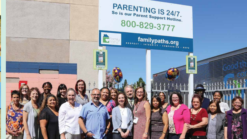
LEFT: Dad and son in Family Yoga class. RIGHT: Family Paths' Staff at new signage Ribbon Cutting

We received a total of 6022 hotline calls in 2014!